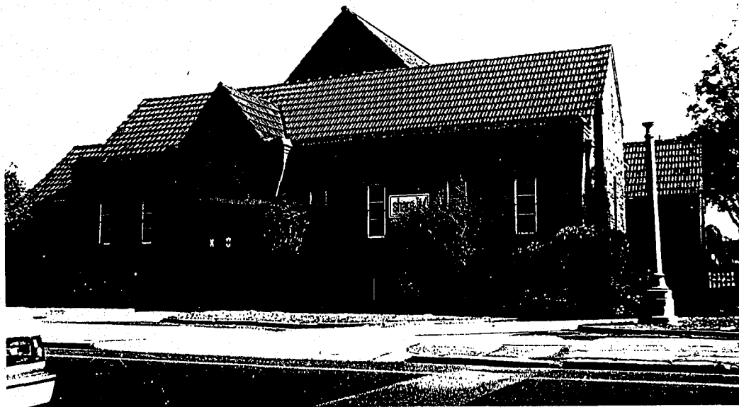
4-19 Peter Fraser Memorial Hall, 304 Barkly Street