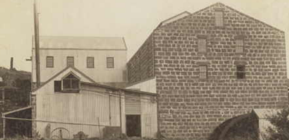
STARCH WORKS FYANSFORD