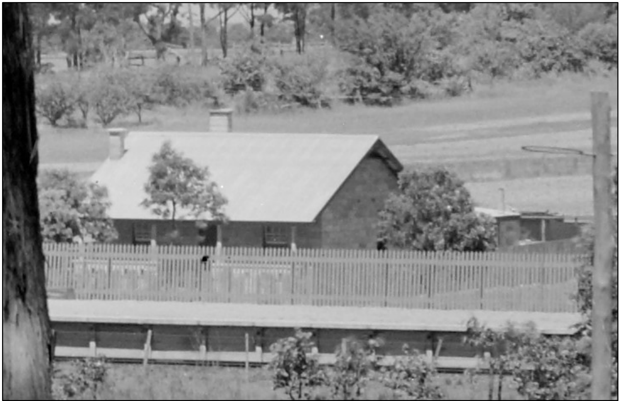
Figure 6: Close up of the Boronia Station Mistress' Residence in 1923-1928, as depicted in Figure 5.