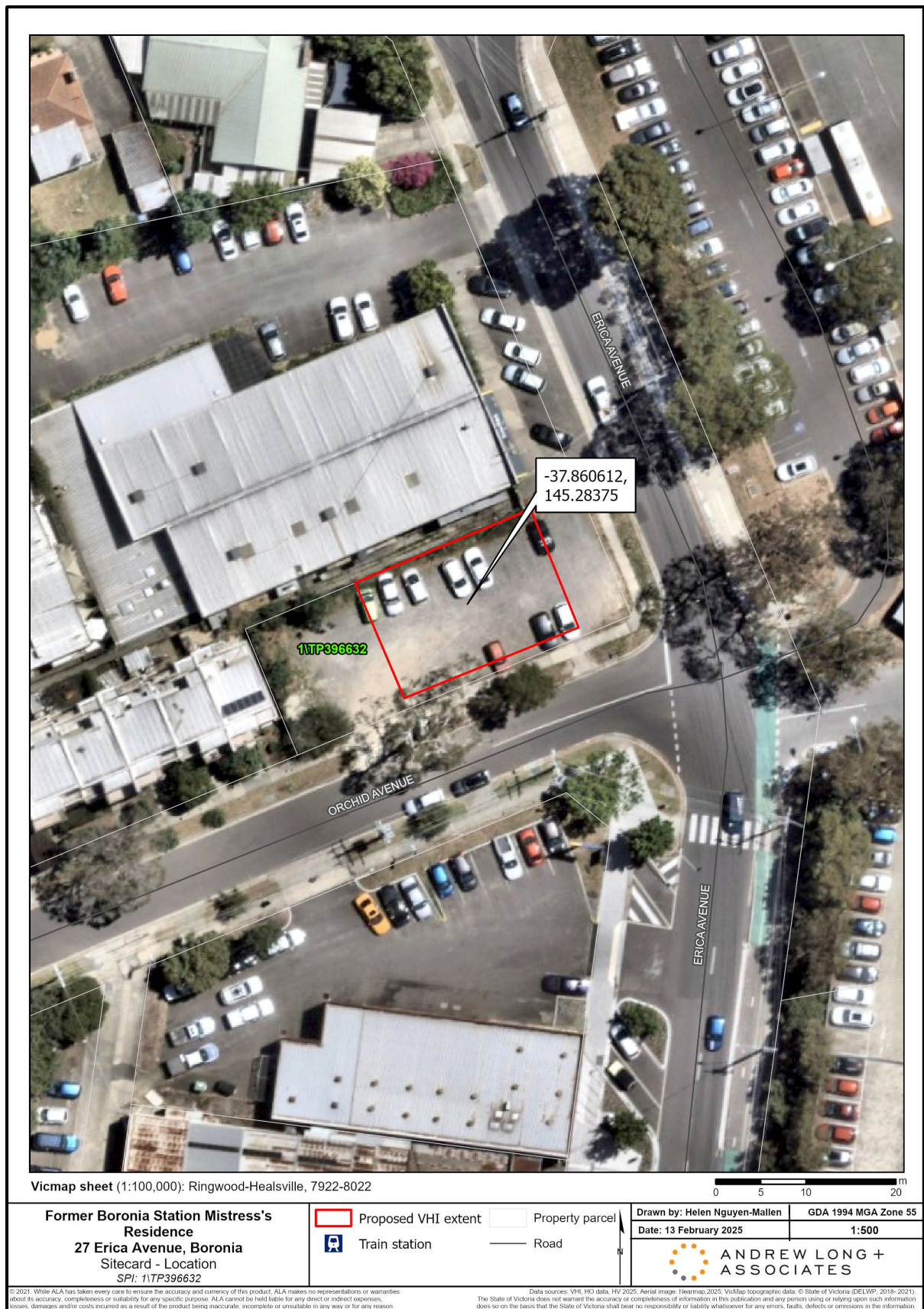
Figure 1: Proposed VHI place extent for the Former Boronia Station Mistress' Residence