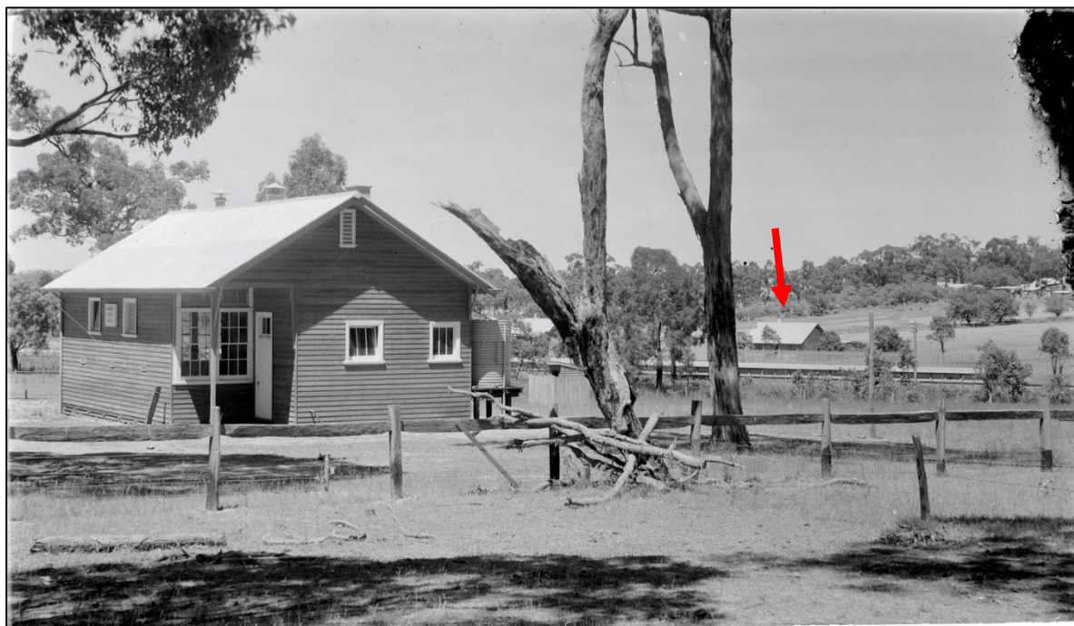
Figure 5: 1923-1928 photograph of the Boronia State School, view south-west, with the Boronia Station Mistress' residence visible in the background