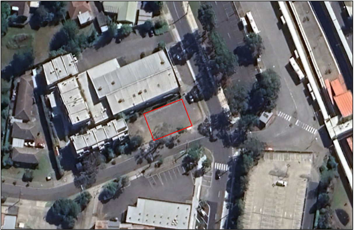
Figure 14: 25 February 2024: satellite image, with the location of the former Boronia Station Mistress' Residence outlined in red