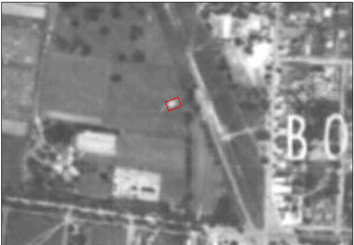
Figure 7: 1945 Adastra Airlines aerial photograph, with the Boronia Station Mistress' Residence outlined in red