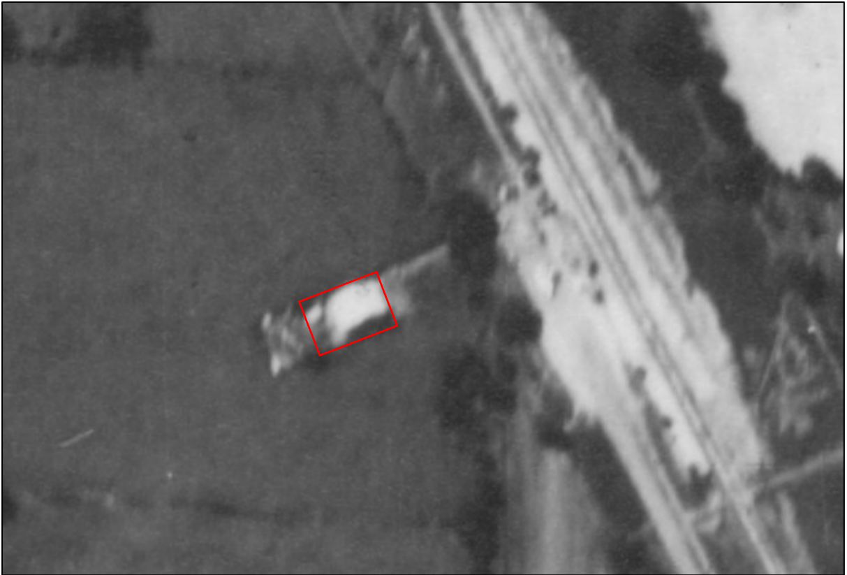
Figure 8: 1951 aerial photograph, with the Boronia Station Mistress' Residence outlined in red (Melbourne and Metropolitan Project No. 2. Run 17, Frame 81)