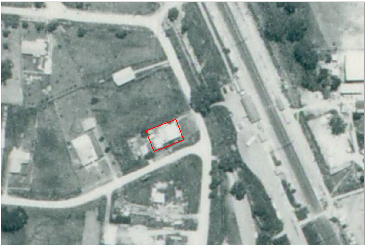
Figure 9: 1962 aerial photograph, with the Boronia Station Mistress' Residence outlined in red (Scoresby Project. Run 3, Frame 30)