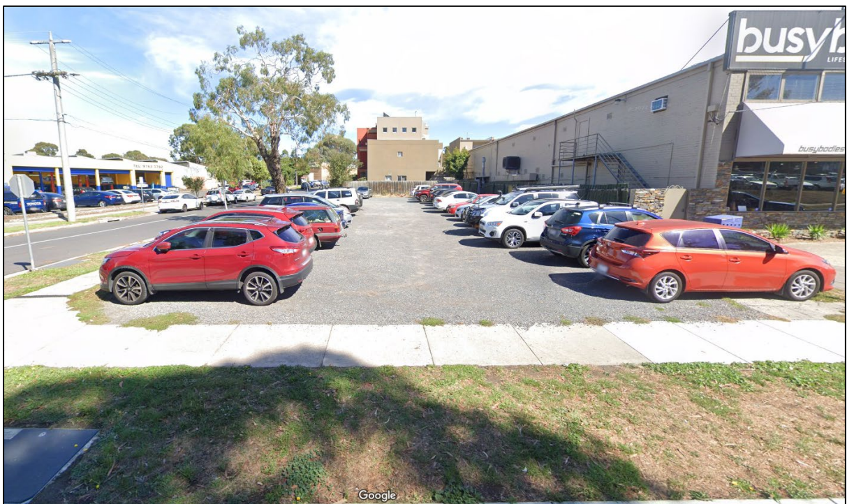
Figure 3 : April 2019 Google Street View capture of the Former Boronia Station Mistress' Residence, view south-west from Erica Avenue.