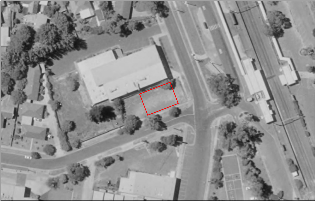
Figure 12: 1987 aerial photograph, with the location of the former Boronia Station Mistress' Residence outlined in red (Western Port Foreshores. Run 8, Frame 25)