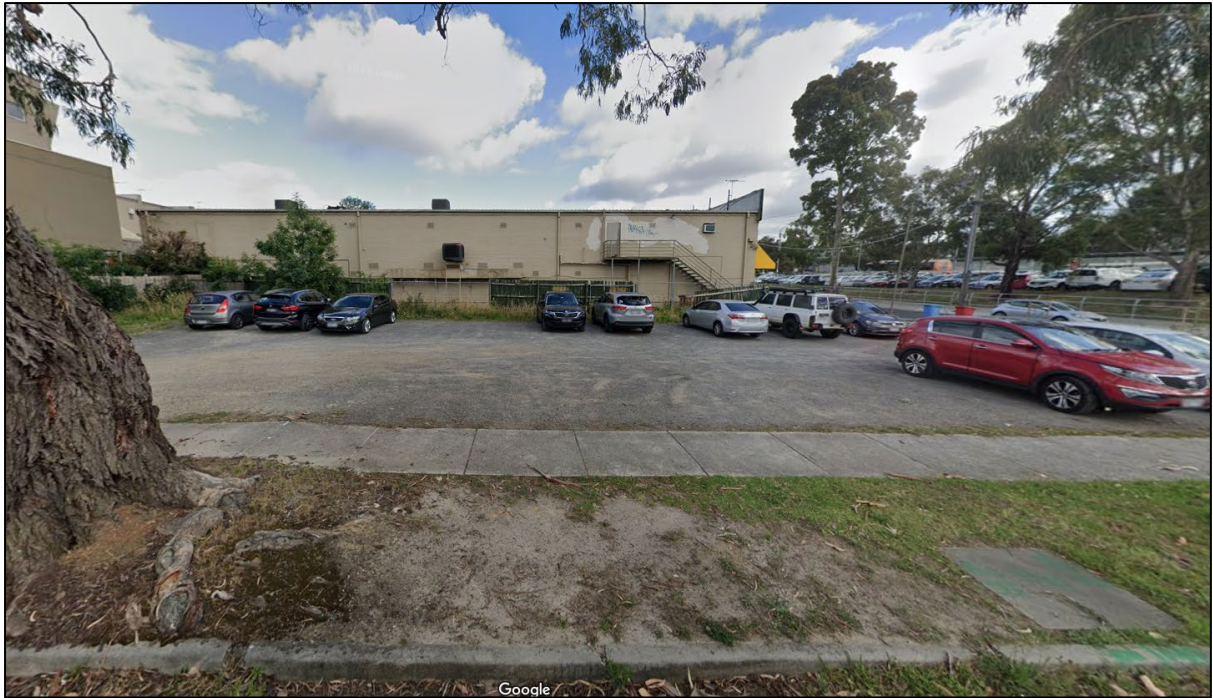
Figure 2: December 2024 Google Street View capture of the Former Boronia Station Mistress' Residence, view north-west from Orchid Avenue.