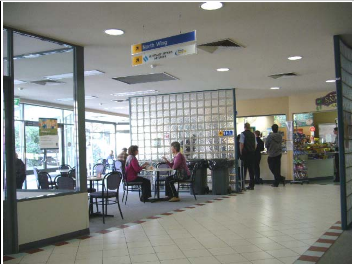
Kiosk in the centre of Perrin Plaza

Location: mid site Built: 1958 Date range: 1958 and reconfigured again in the 1990s and 2000s Designer: Originally part of the YFGS work Builder: