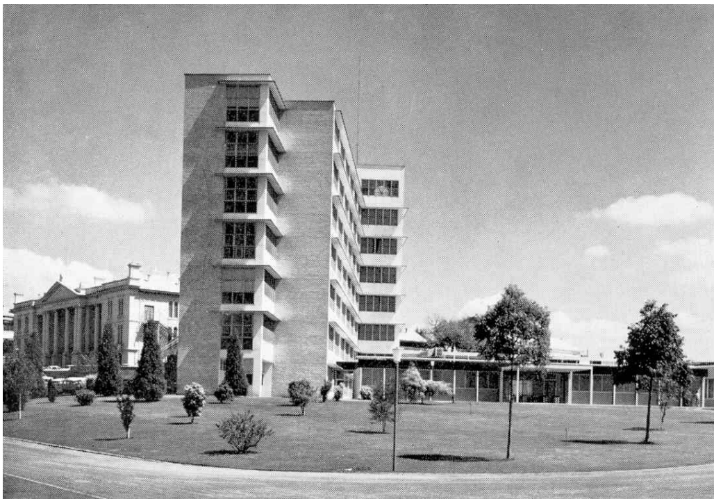
East Wing and View of the Day Hospital 1970.

Of some historical significance in the ongoing use and continuity of naming. Of minimal / indeterminate aesthetic (architectural) significance.