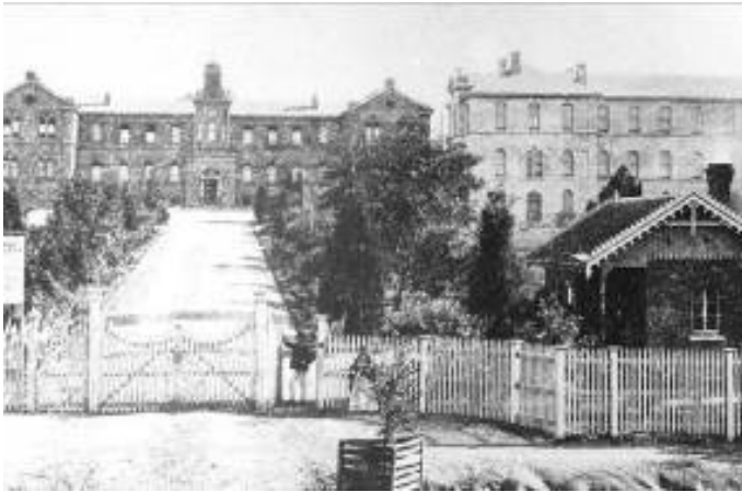
Bendigo Hospital 1874

Formerly Bendigo and Northern District Base Hospital