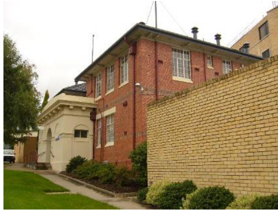
Lansell Laboratory Building