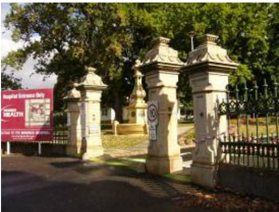
Main Entrance and Fountain