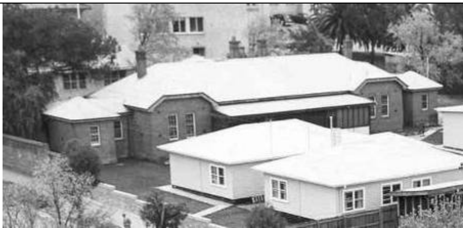
The Old Library in the 1960s

Contributory significance to the major historic theme and to the site as part of the group of the structures which define the site's earliest history.