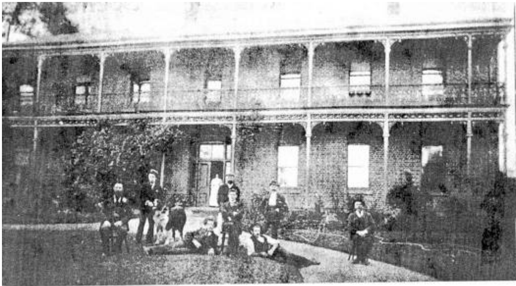
Male staff in front of Modesty House, 1900