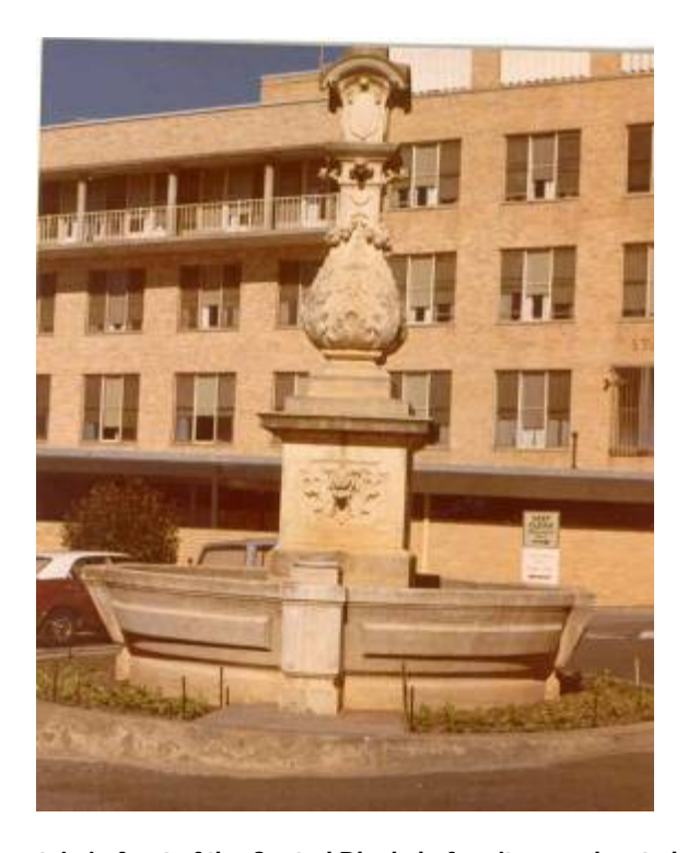
The fountain in front of the Central Block, before it was relocated, 1972.