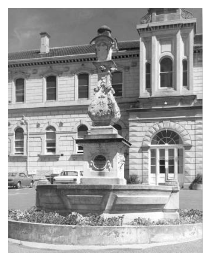
The fountain in front of the Central Block, before it was relocated, 1972.

The fountain is important as a decorative landscape element and as evidence of the many donations made to the development of the hospital site by Bendigo residents.