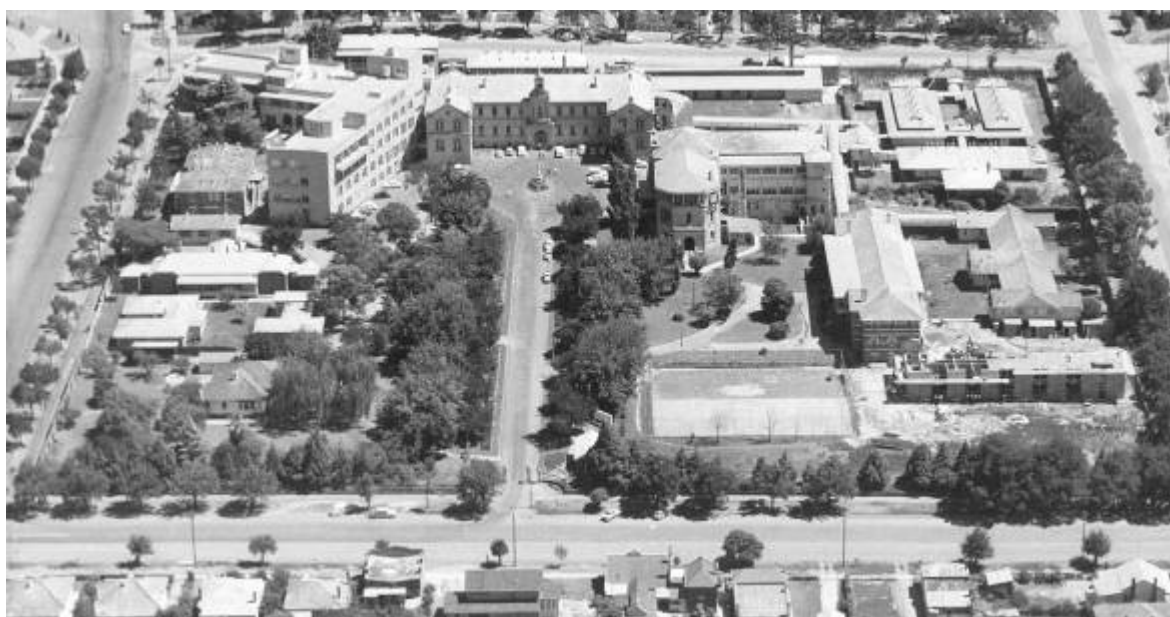
Trees lining the central driveway and boundaries in c.1963.