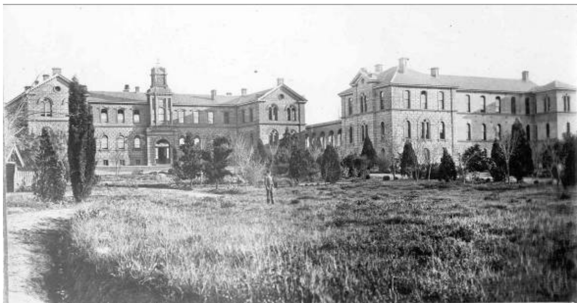
The landscaped grounds in front of the Central Block and Bowen Wing, 1880.