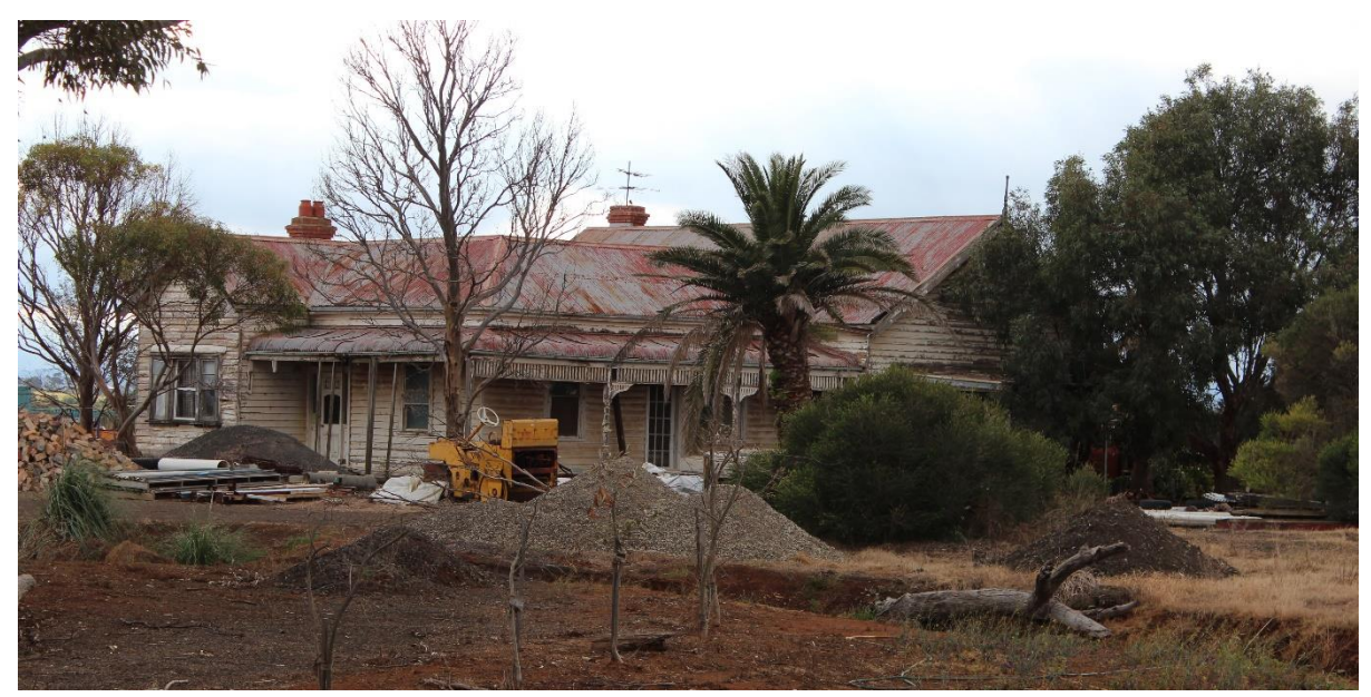
Stoneleigh from Sinclairs Road, Rockbank