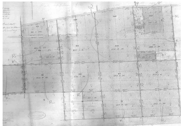
30 Dingle, op cit , p 193.