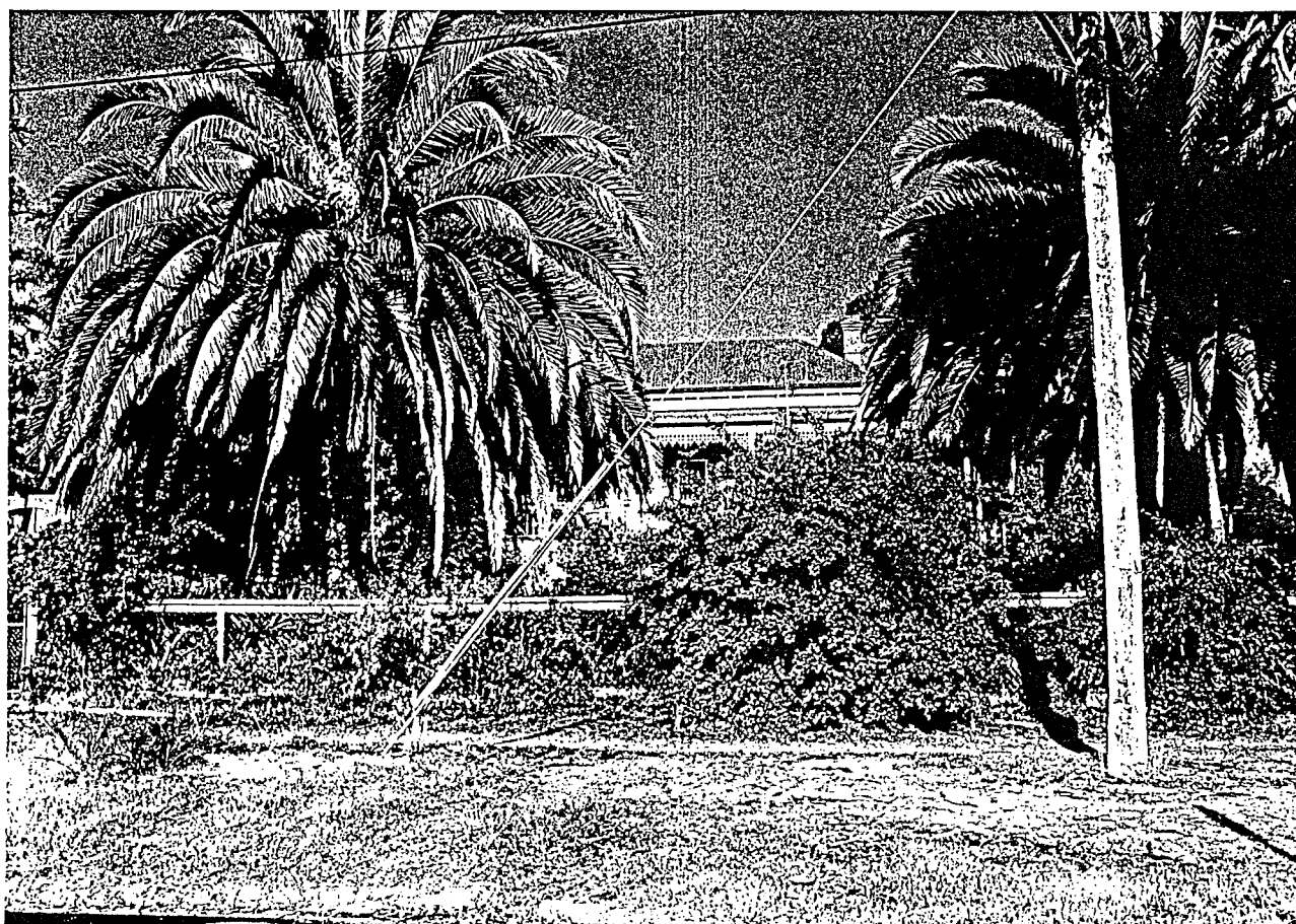
1-14 Canary Island Date Palms at 3 Barkly Terrace, Bendigo-locally important as distinctive trees, in this case (with the fence) probably from the 1920s-30s, later than the house date.