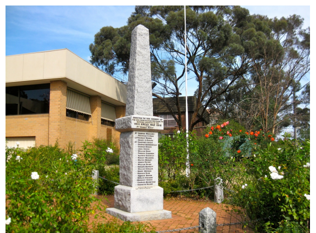
Image: Photograph of the War Memorial in 2010, at its second location in front of the RSL Hall at 804 Main Road, Eltham

The obelisk remained on its original site until the 1950s when the Eltham Shire Council decided that the open land area west of Main Road, from Bridge Street to Panther Place and on both sides of the Diamond Creek, would become a landfill garbage tip. As a result, in the early 1950s the obelisk was removed from its original site and re-erected in front of the Eltham RSL building at 804 Main Road Eltham.