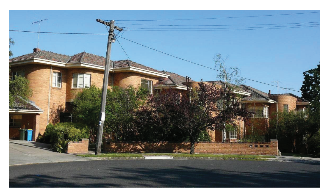
Sandra Court Flats, 6 Mackie Court (1940s; contributory). A near identical building is located in the corresponding position at 7 Younger Court (1940s; contributory).