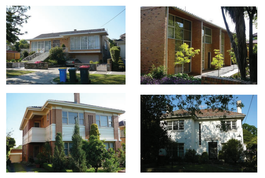
Clockwise from top left: 62 Stevenson Street (c.1956; significant); 8-11 Younger Court (1957; significant); 34 Carson Street (1940s; contributory); and 61 Studley Park Road (1940s; contributory).

21-23 Edgecombe Street duplex (1940s; contributory).