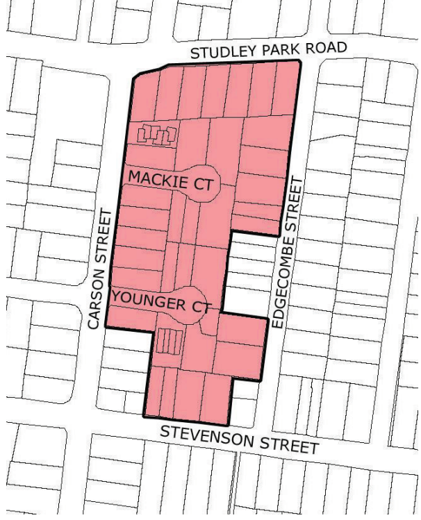
Clutha Estate Precinct: Heritage Overlay plan.