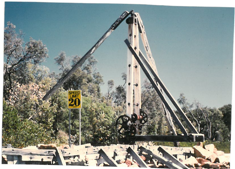
3-LEGGED JIB CRANE.