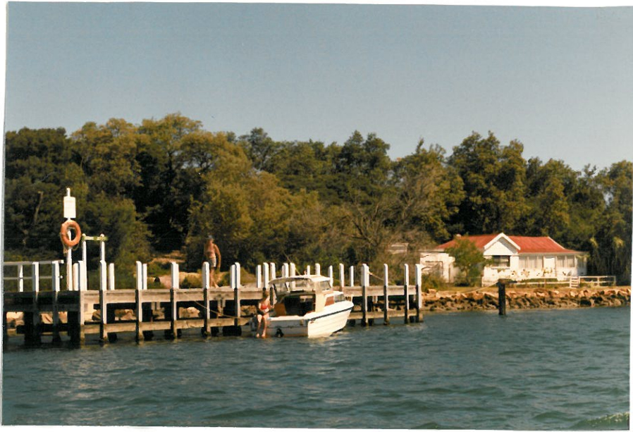
HOPE TOWN CHANNEL WITH JETTY & 'SITE 18'