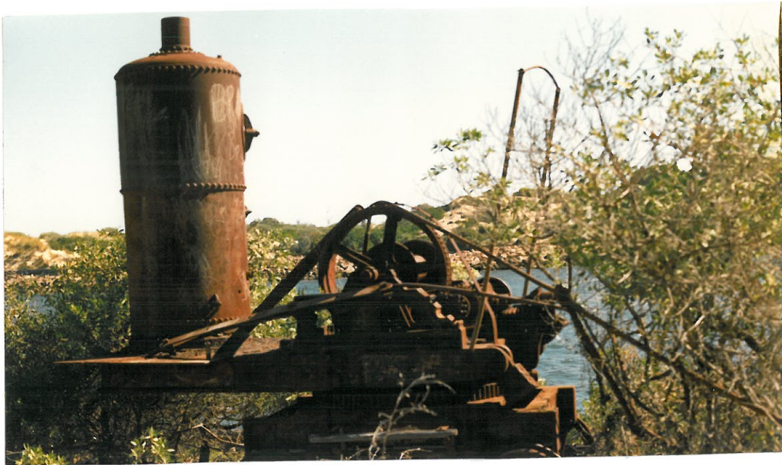
STEAM TRACTION CRANE REMNANTS