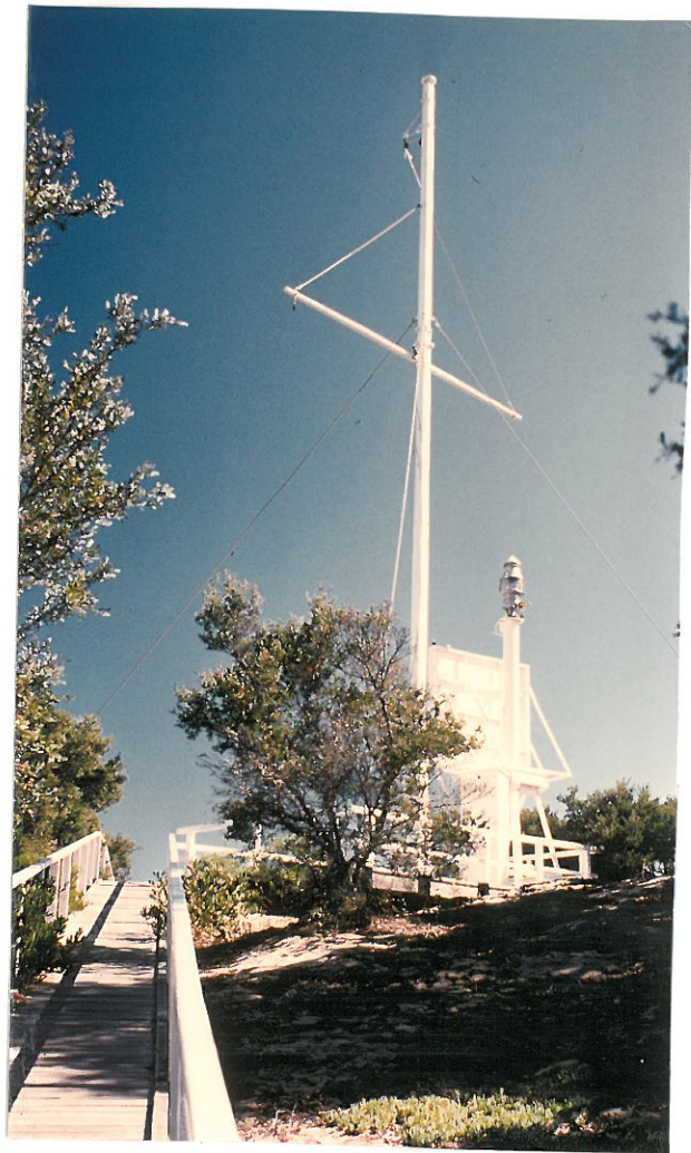
BOARDWALK & FLAGSTAFF.