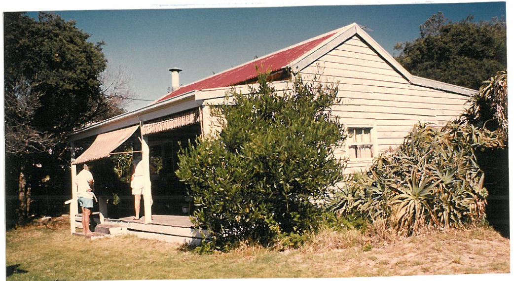
"SITE 10" HOUSE