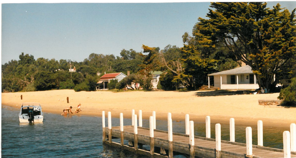
EAST SIDE BEACH. CUNNINGHAM ARM.