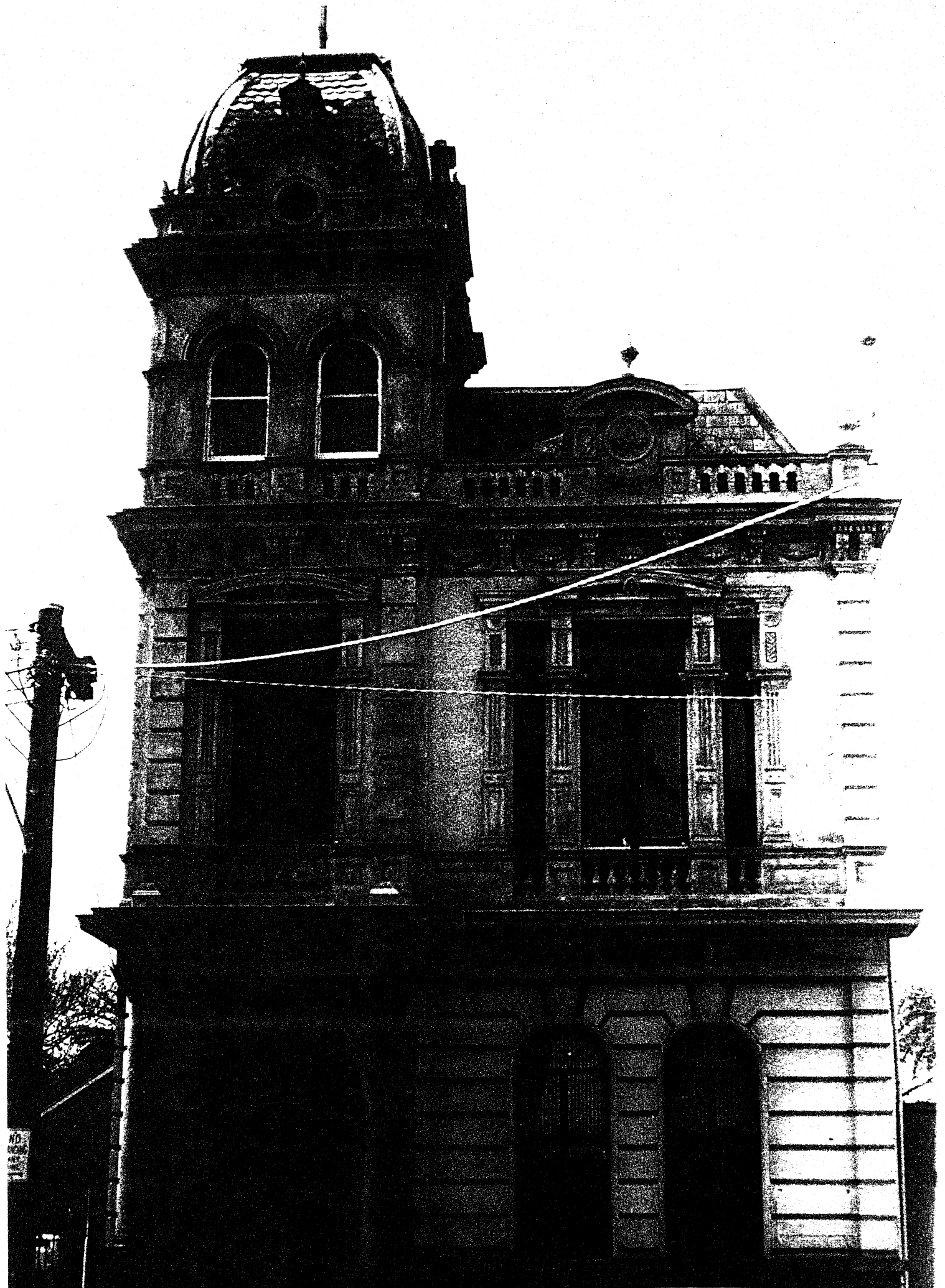
RECHABITE HALL 10 Clarence Street, Prahran