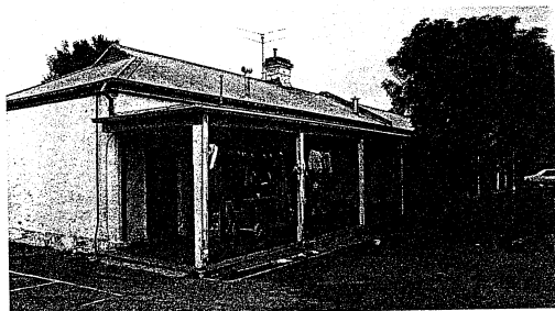
Lord Mayor's Children's Camp

To the extent of all the buildings and land as defined by the Heritage Council.