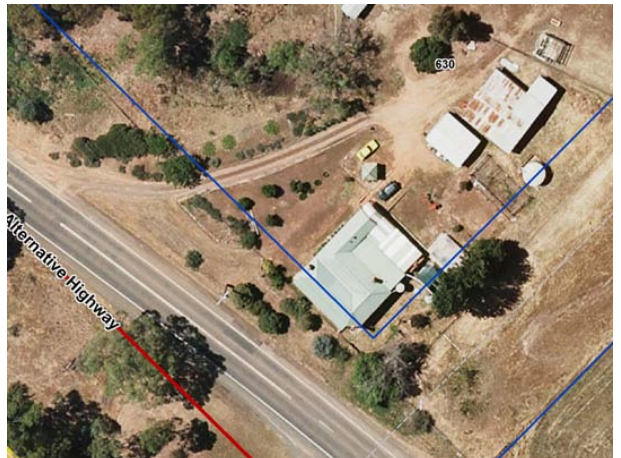
Left: Brick chimney at chamfered corner, possibly a former entrance. Right: Aerial view, 2010.