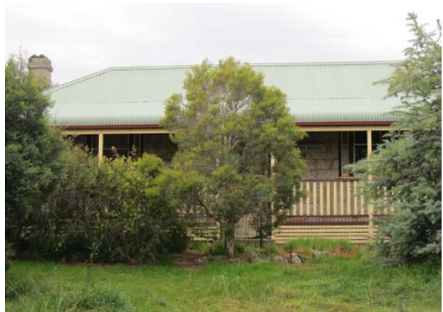
Left: North elevation, as seen from the Calder Alternative Highway. Right: Front (west) elevation.