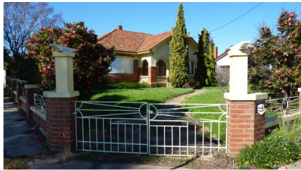
Left: Bonhaven pictured c. early 1990s (Source: Photographic History of Kangaroo Flat , 1994, v. 1). Right: Bonhaven looking south-west, 2010