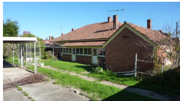
Left: Motor garage to the north of the house. Right: Rear view.