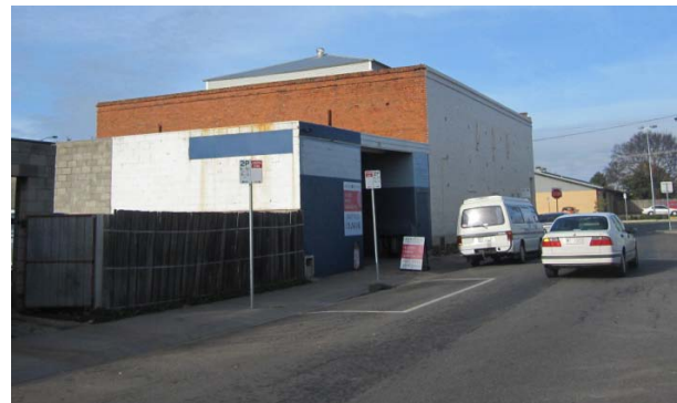
Left: South and east elevations. Right: Rear elevation; note lantern roof.