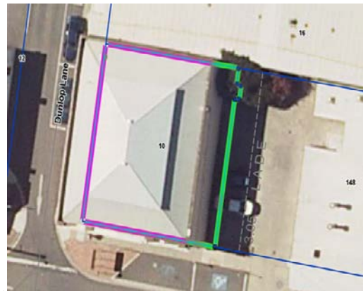
Left: East elevation, note angled brick course, evidence of a pre-existing structure in this location. Right: Aerial view, 2010.