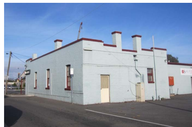
Left: Detail of south elevation. Right: Rear (north) elevation.