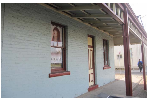
Right: South and east elevations (2010).