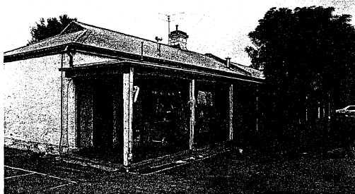
Lord Mayor's Children's Camp

To the extent of all the buildings and land as defined by the Heritage Council.