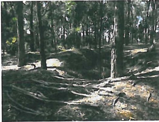
Plate 1: View of largest excavated area (trench) of mining landscape facing north east.