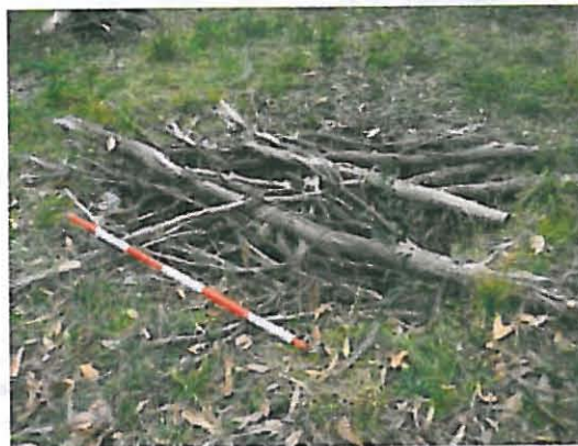
Plate 3: View of mining hole covered for safety.