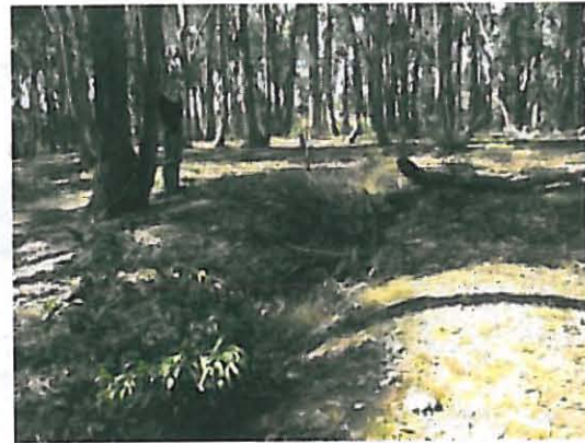
Plate 2: View of seconded largest excavated area (trench) of mining landscape facing north east.