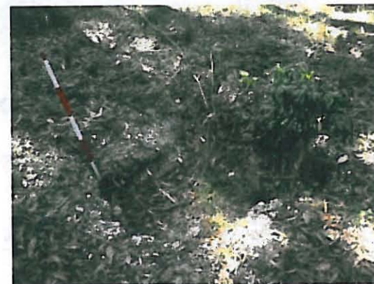
Plate 4: View of mining hole uncovered.