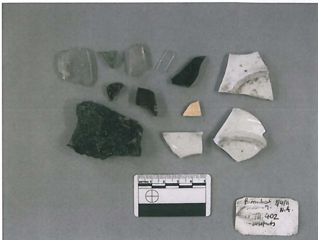
Fig. 9: Finds from Test Hole 402, Church Road site