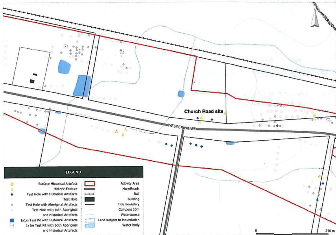
Fig. 3: Subsurface testing in the Trawalla area, showing concentrations of historic artefacts near the Church Road site (1:6,000)