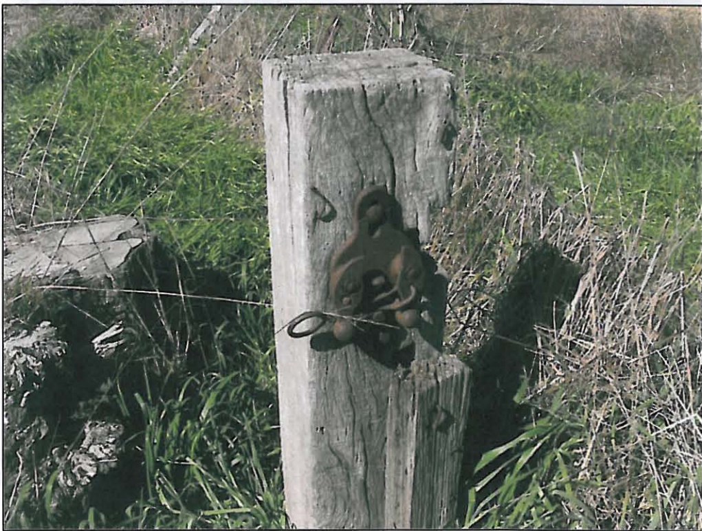
Fig. 7: Detail of feature (latch?) on wooden post at Church Road site (W. Anderson, 8/4/2011)