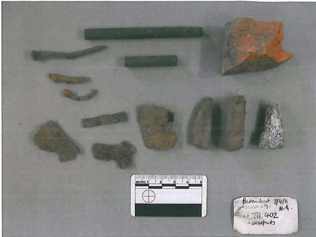
Fig. 8: Finds from Test Hole 402, Church Road site