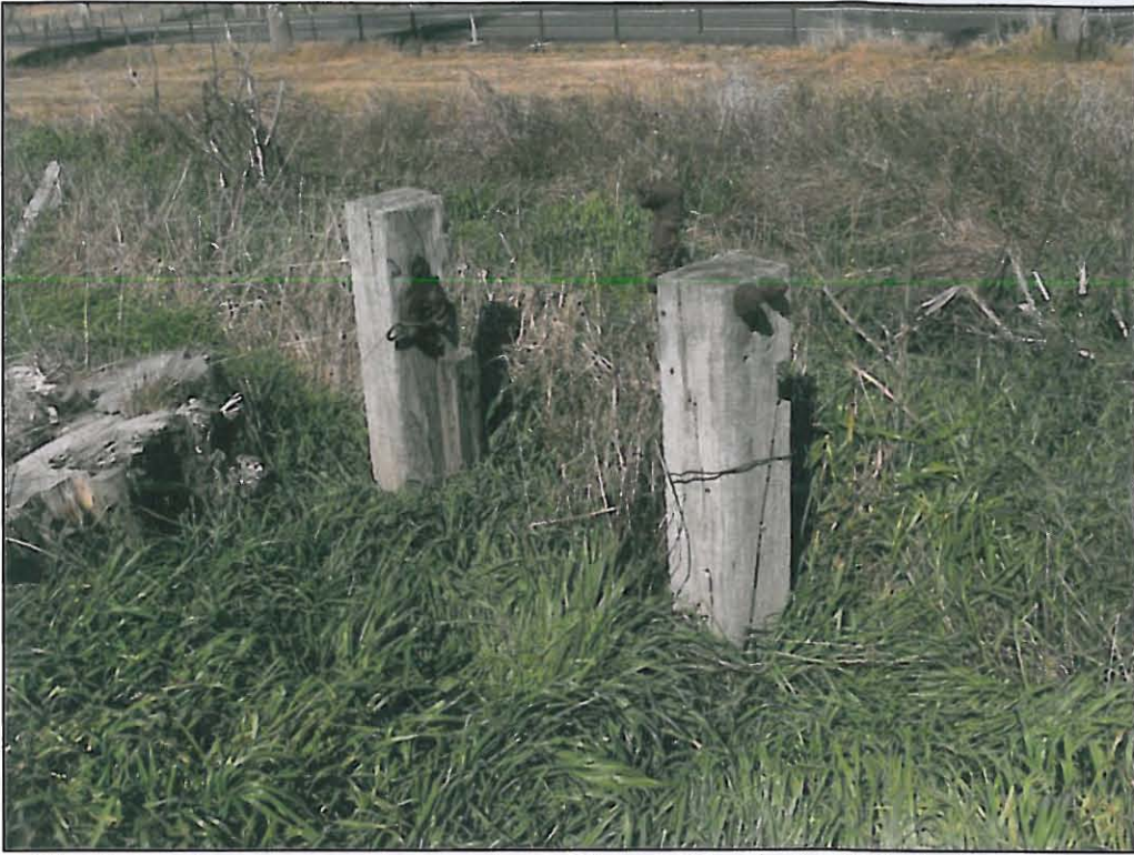
Fig. 6: Feature on wooden posts at Church Road site (W. Anderson, 8/4/2011)