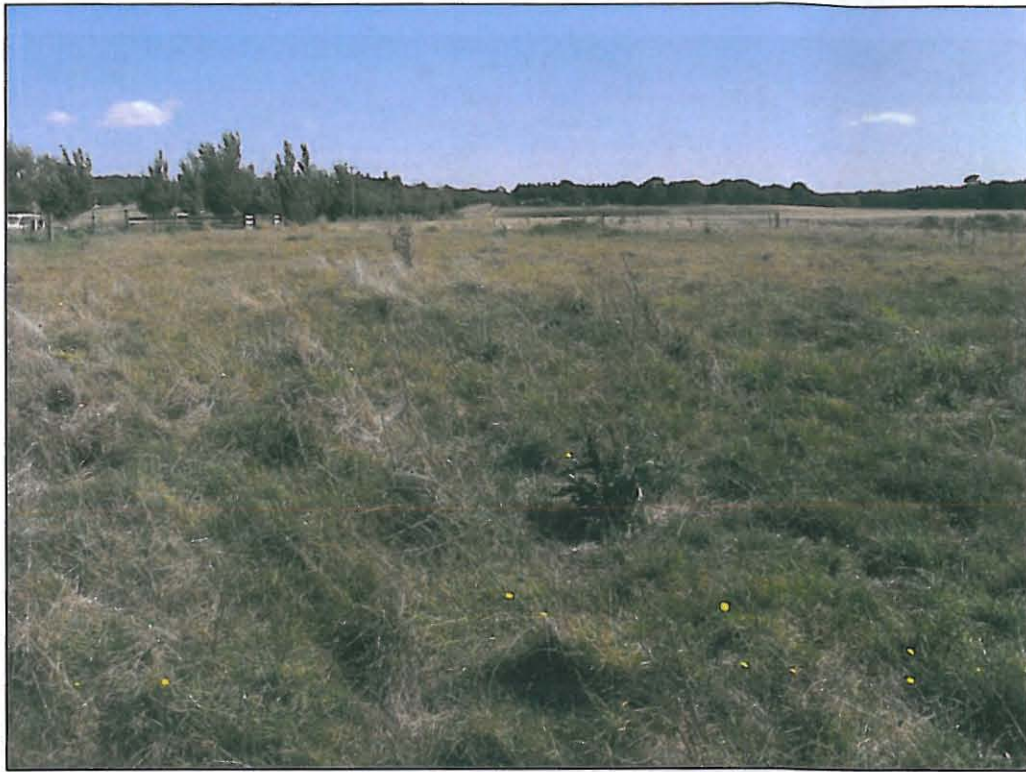
Fig. 4: View of Church Road site, facing west (W. Anderson, 8/4/2011)