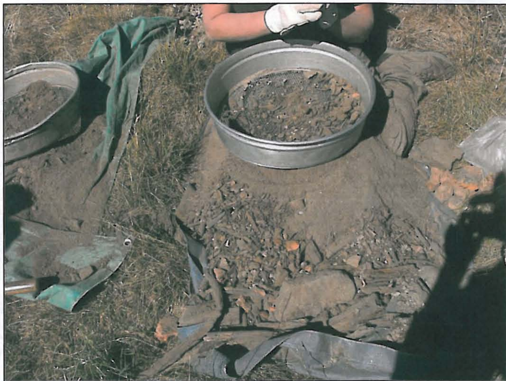
Fig. 5: Spoil from TH402, containing wood and detritus (W. Anderson, 8/4/2011)