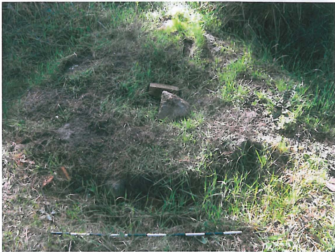
Fig. 5: Basalt feature in the southeast of the site (W. Anderson, 27/7/2011)