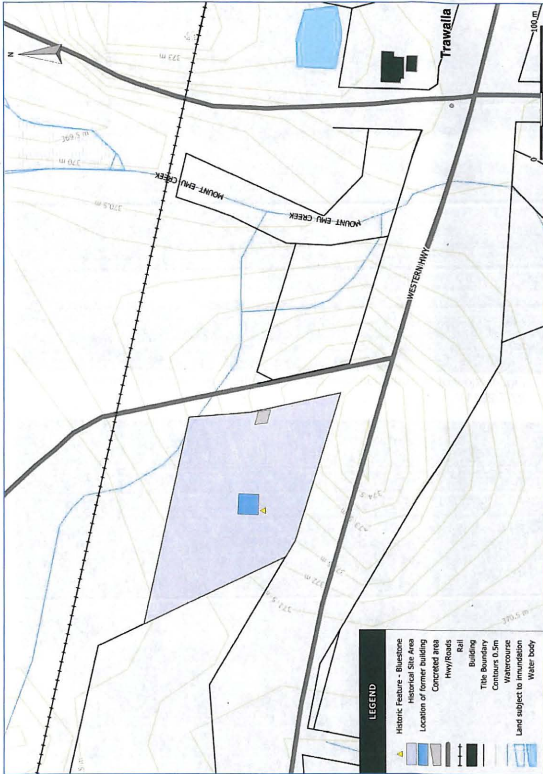
Fig. 3: Plan of Trawalla School (scale = 1:2,000)