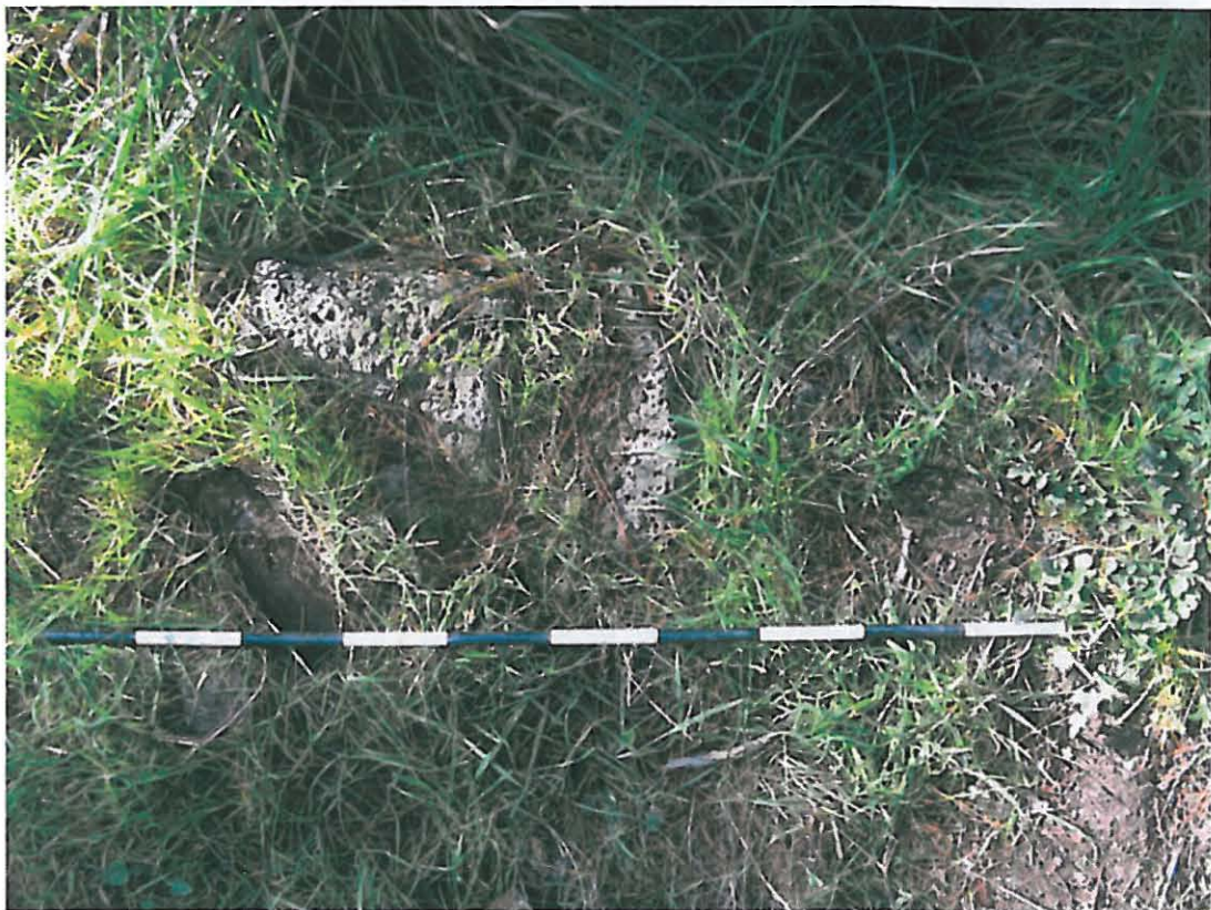
Fig. 7: Basalt feature in the southeast of the site (W. Anderson, 27/7/2011)