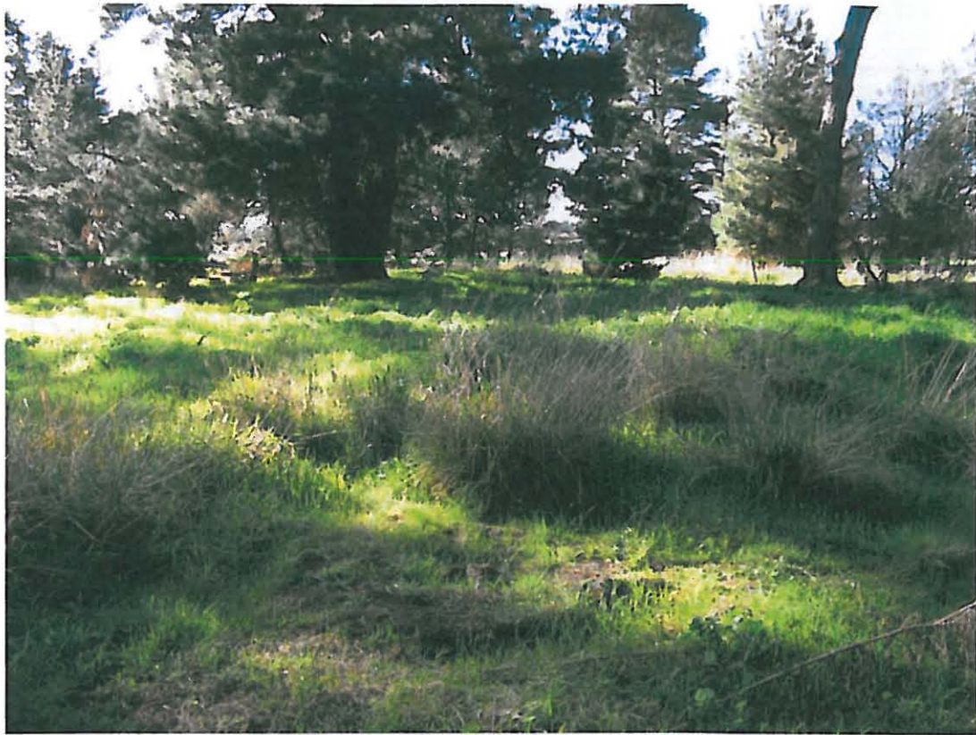
Fig. 4: View of the southeastern part of the site, facing north (W. Anderson, 27/7/2011)