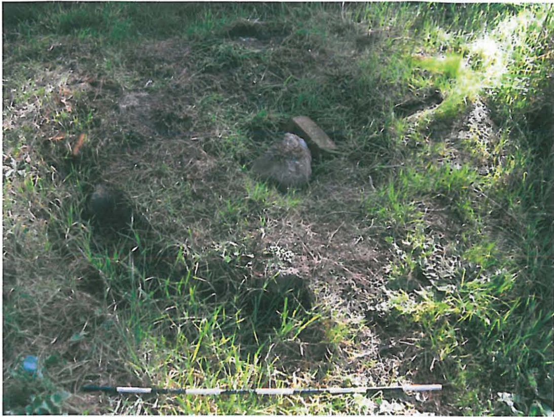
Fig. 6: Basalt feature in the southeast of the site (W. Anderson, 27/7/2011)