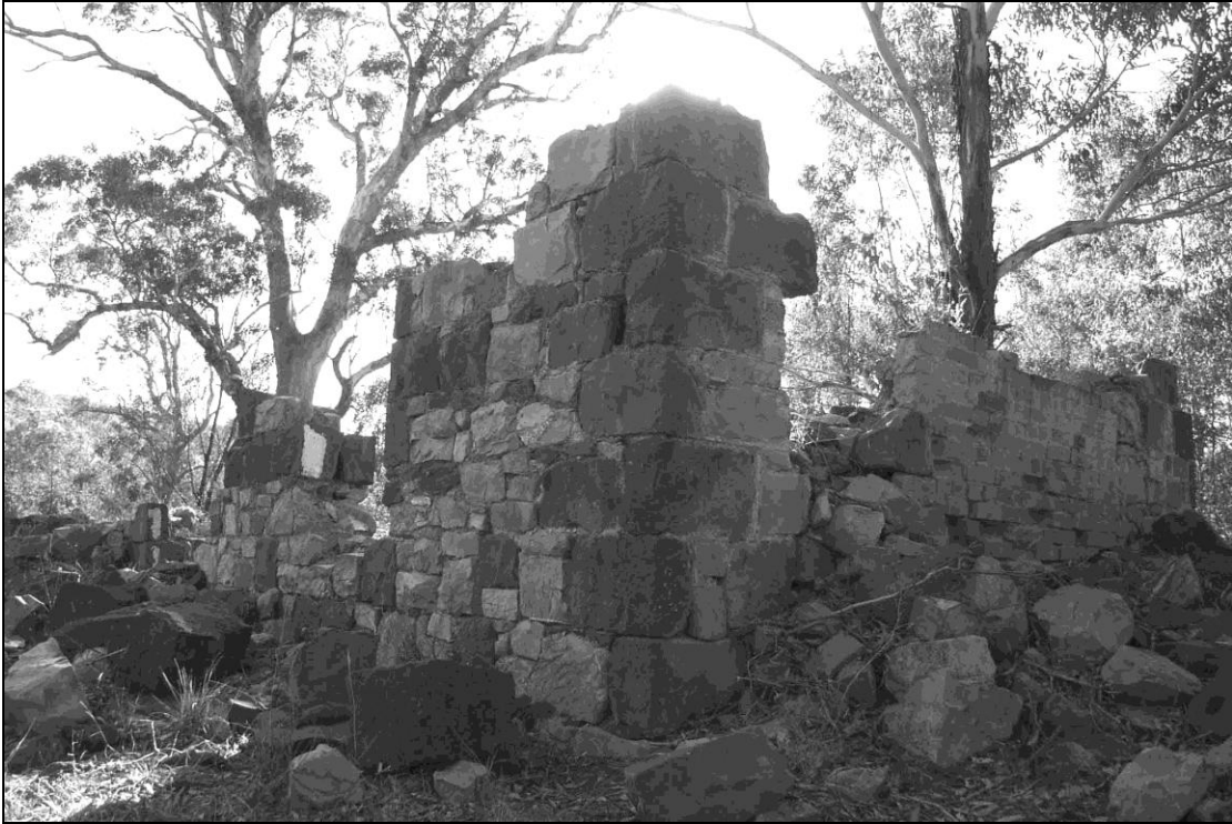
Ruin, reputedly of the former Greenhills Station Shearers' Quarters.