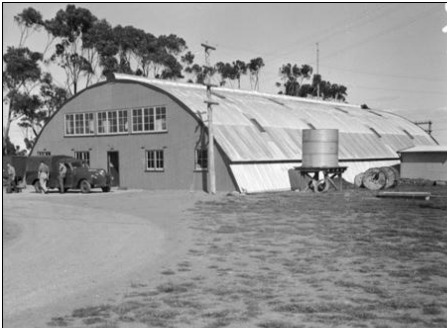
Diggers Rest, 1945. 'Exterior view of the new Igloo Building housing land headquarters signals.