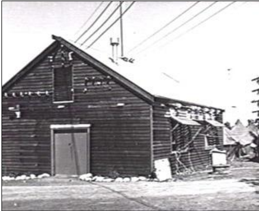
Diggers Rest, November 1945. The exterior of the old 'shack' at Diggers Rest, used by Land Headquarters Signals to house transmitters. This would have been one of the converted farm buildings.