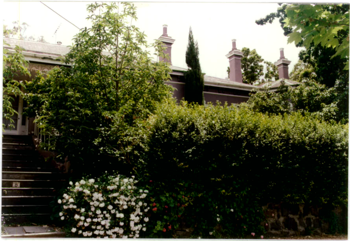
8 Shakespeare Grove