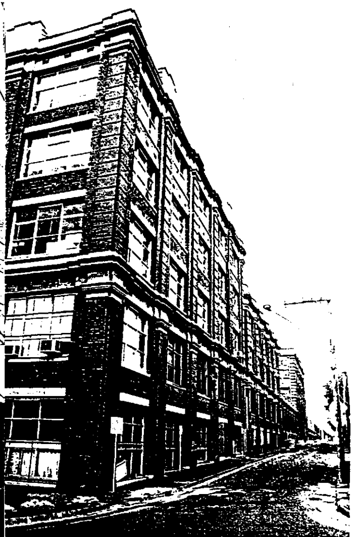
Little Oxford St.