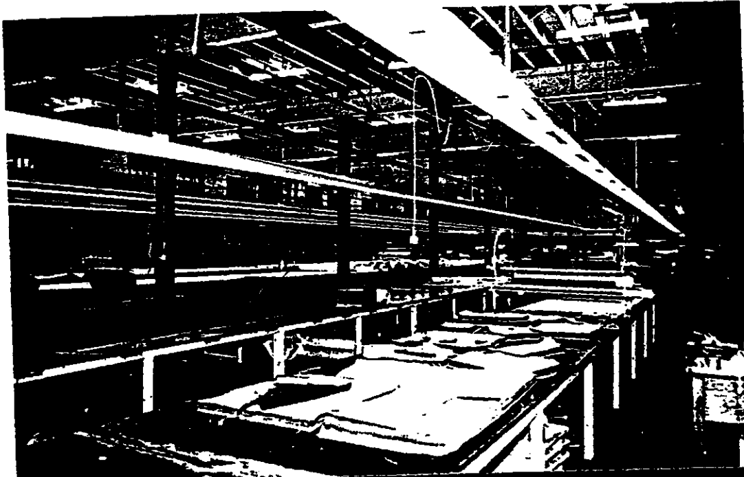
Ground Floor level.