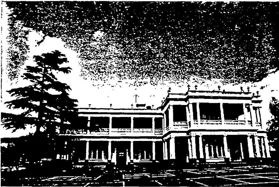
East facade: original symmetrical house on the left, 1919 additions on the right.