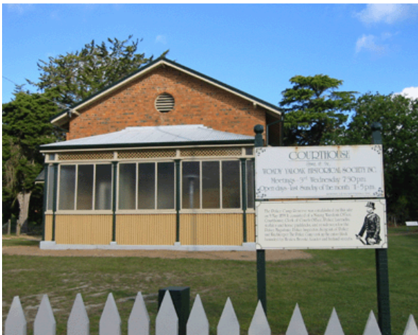
November 2003.