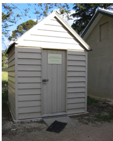
November 2003.