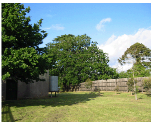
November 2003.