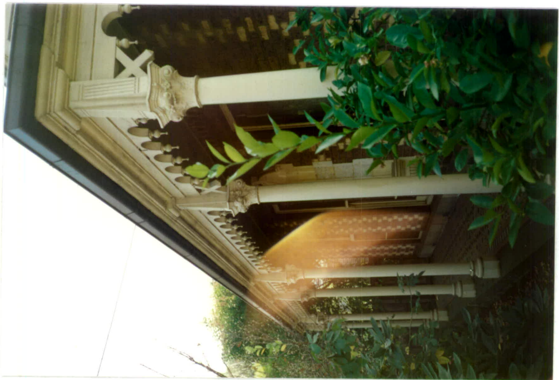
79 Oxley Road