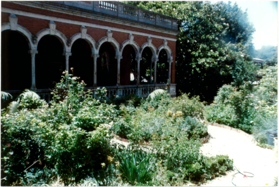
21 Isabella Grove.