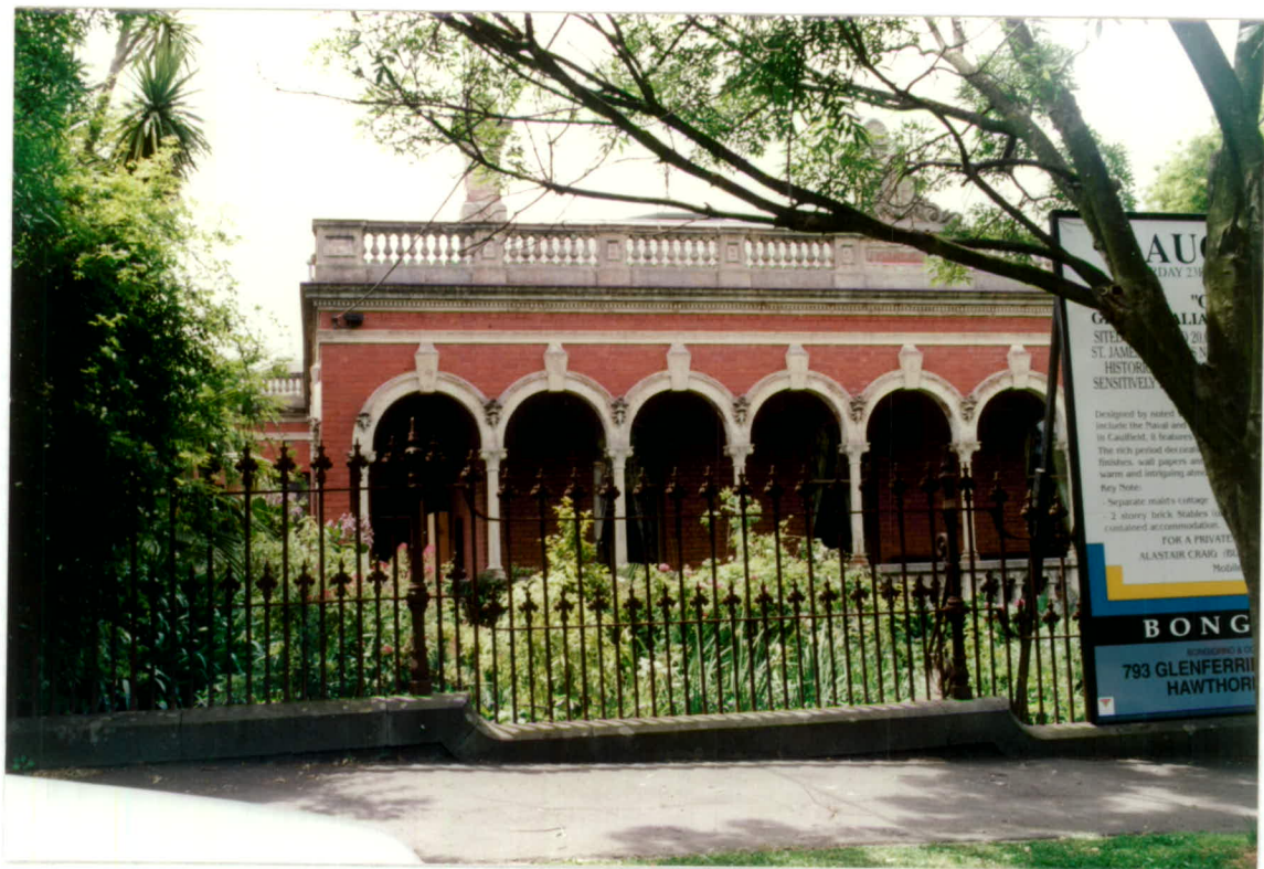
21 Isabella Grove