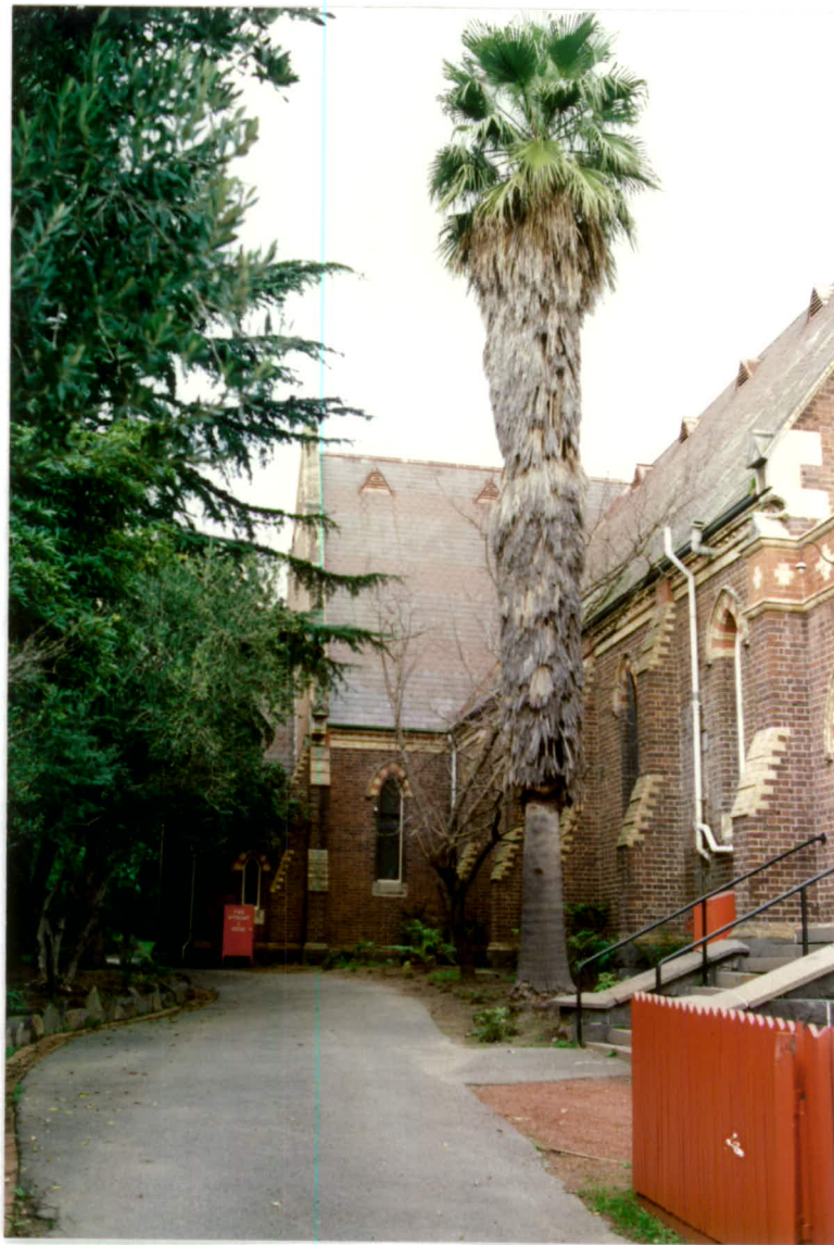
500 Bunwood Road