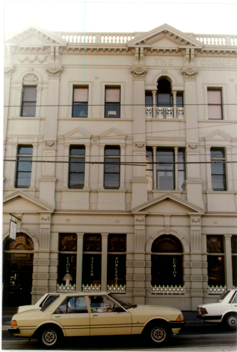
348 Burwood Road