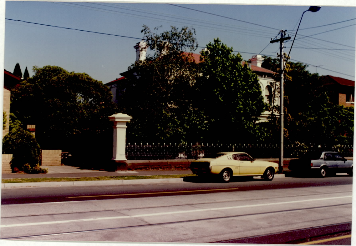
997 Burke Road