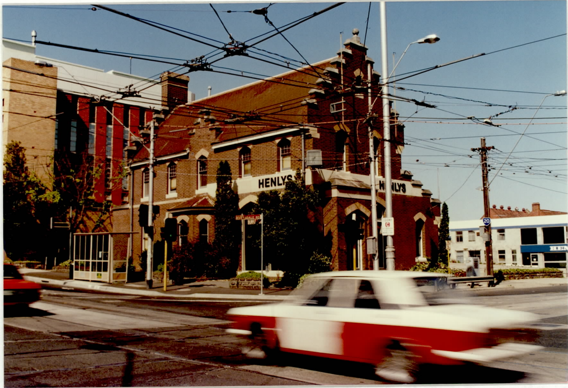
705 Burke Road