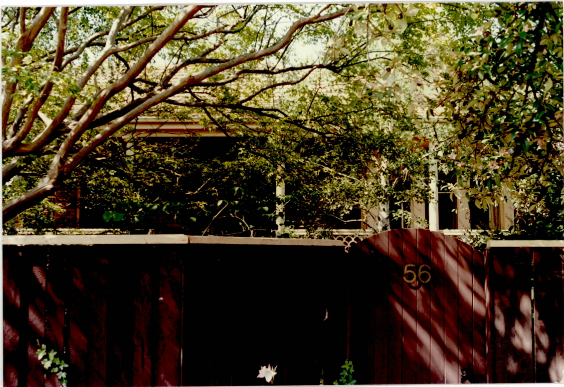
56 Auburn Road