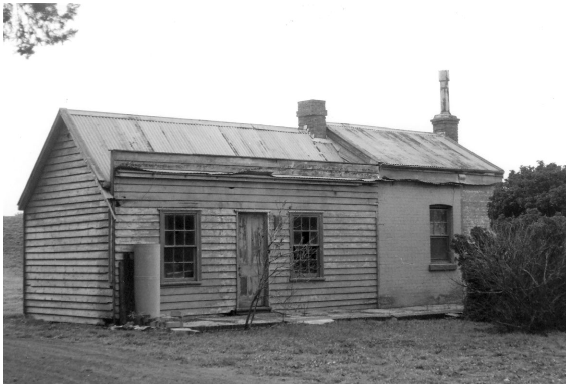
Barwon Water Reservoirs & Structures, Lovely Banks. Former Caretaker's Cottage.