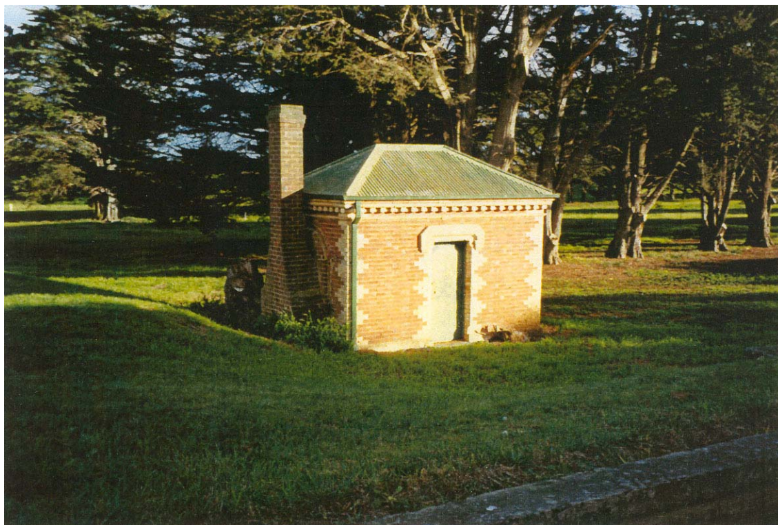
Barwon Water Reservoirs & Structures, Lovely Banks.

Brick Outbuilding near Water Basin no.1.