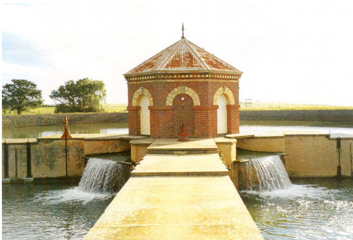
Barwon Water Reservoirs & Structures, Lovely Banks.

Brick Lime House/Inlet Tower & Settling Pond.