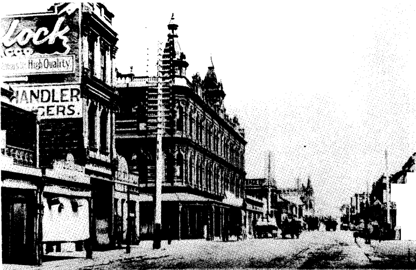
(17) Brunswick Street, c1900