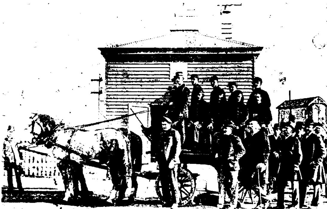
(21) Old Fitzroy North Fire Station c1880-91