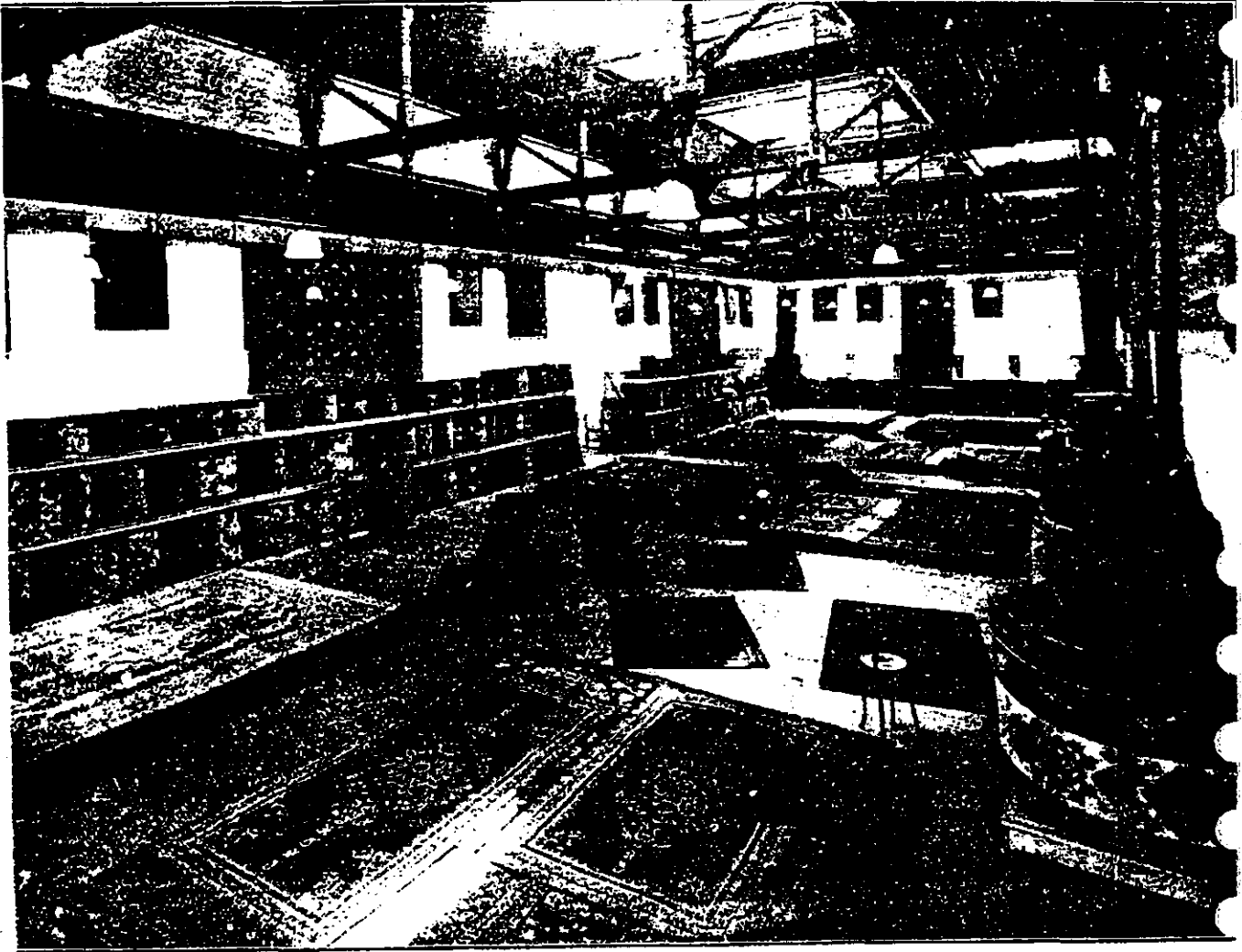
CARPET SHOW ROOM.