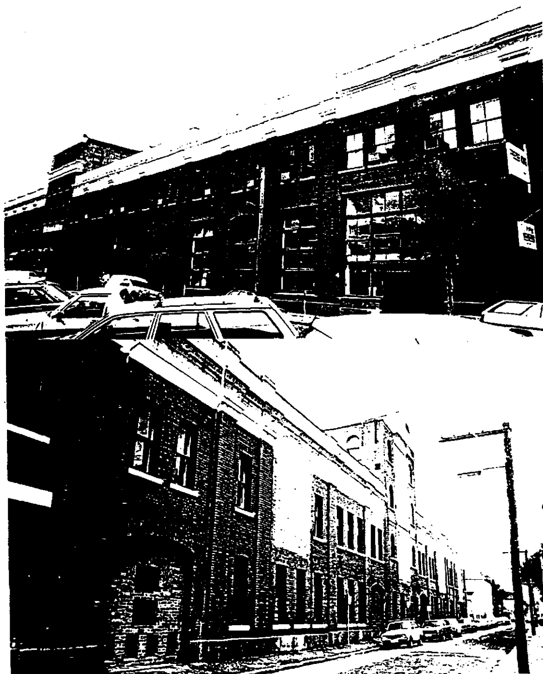
Oxford St north end