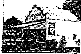
No. 41 Shop, 308 Warrenheip Street.

An isolated and small, single storey commercial building which retains its shopfront form largely intact. A wide verandah lines the street facade and a stepped parapet features above.