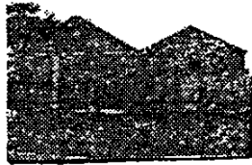
No. 43 Masonic Hall, 604 Warrenheip Street.