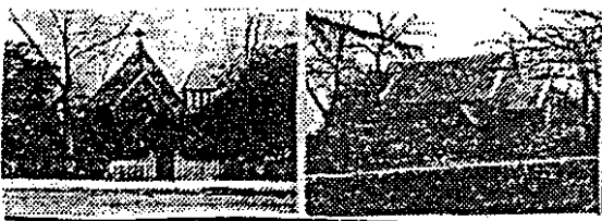
No. 45 Holy Trinity Anglican Church and School, 702 - 8 Warrenheip Street.

The Anglican Church School was established in this brick building in 1857. Later in 1861 the foundation stone for the church was laid, and the building commenced operation in 1862. The site of the Anglican Church of England was permanently reserved in 1867.