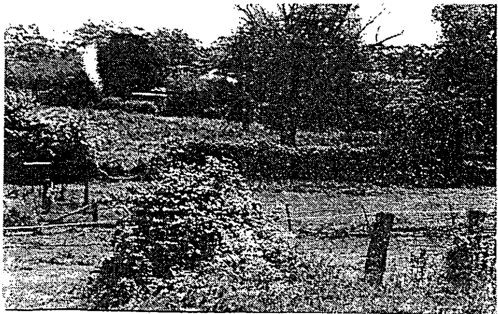
VIEW OF COLEMAN'S SPRING LOOKING WEST SHOWING STAND PUMP.

The only relic of the spring activity is a stand pump, however the water source is still evidenced by the lush surrounding vegetation.