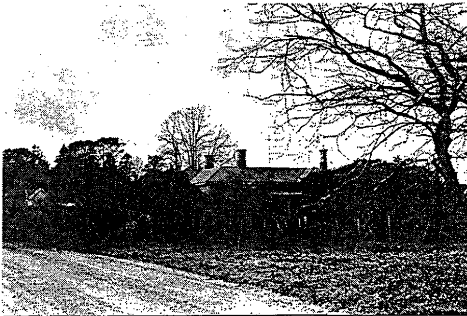
SCOTT STREET LOOKING EAST, WITH GRAVEL ROAD SURFACE AND GRASSY VERGES.

The gravel road surface, grassy verges and open channels retains the early streetscape character in Scott Street. The streetscape is also enhanced by several individual specimen trees, for example the Bunya Bunya Pine at 'Netherby', the Cedar trees at the former Wesleyan Church, and the avenue of Elm trees which line the approach to the former Presbyterian Church.