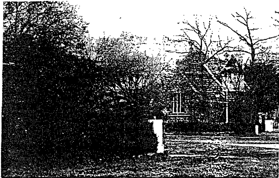
SCOTT STREET LOOKING WEST TO WALLEHERP STREET.

This precinct is recommended for inclusion on the register of the National Estate and to be an Area of Special Significance to be protected under the provisions of Clause 8b of the Town and Country Planning Act. (Third Schedule).