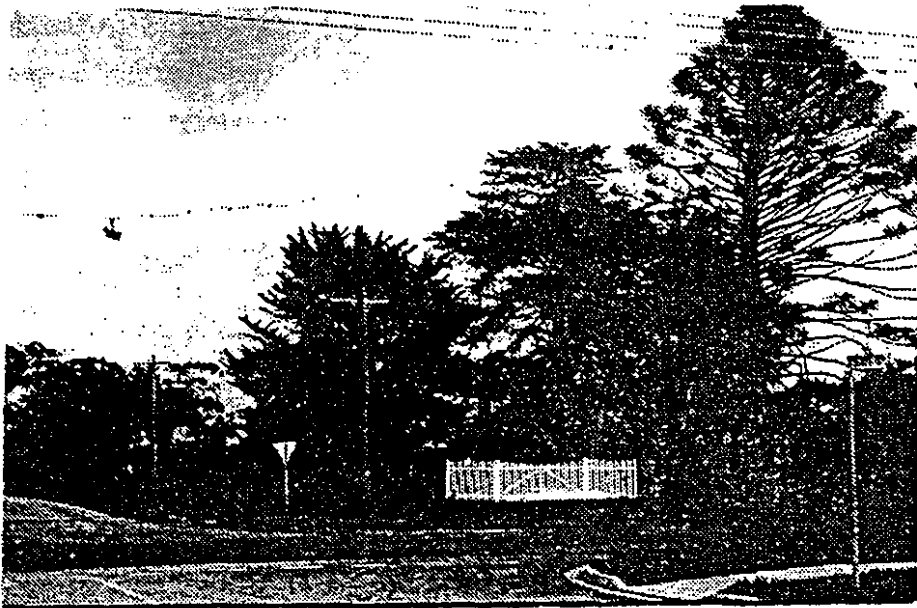
VIEW OF NET FROM SCOTT SHOWING M. SPECIMEN T