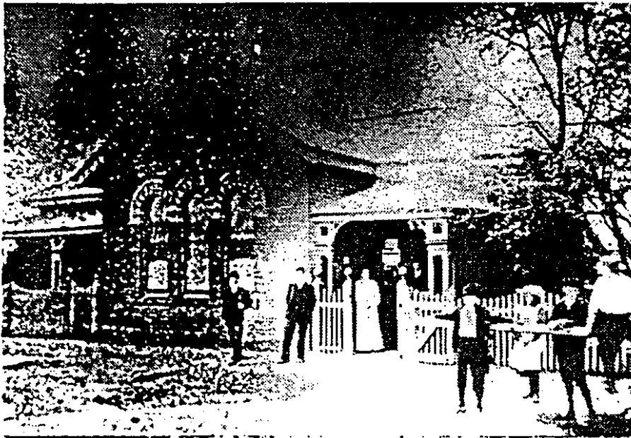
THIS BUNINYONG POST OFFICE, N.D. WITH SCALLOPED PICKET FENCE. INTERMEDIATE PICKETS ARE PAINTED IN A CONTRASTING COLOUR.

Buninyong Telegraph 25 July 1873 4 August 1873 21 September 1873 20 October 1873