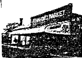
No. 48 f. Grocery, 401 Warrenheip Street.

This shop was constructed in 1860s, most probably for George Whykes, a Grocer. The building is constructed of brick with a corrugated galvanised iron roof. A simple parapet and cornice remain intact. A bullnose profile verandah lines the street facade.