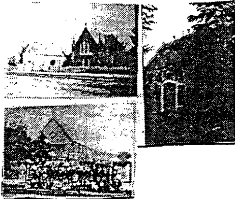
No. 47 f. Methodist Church, 802 - 4 Warrenheip Street.